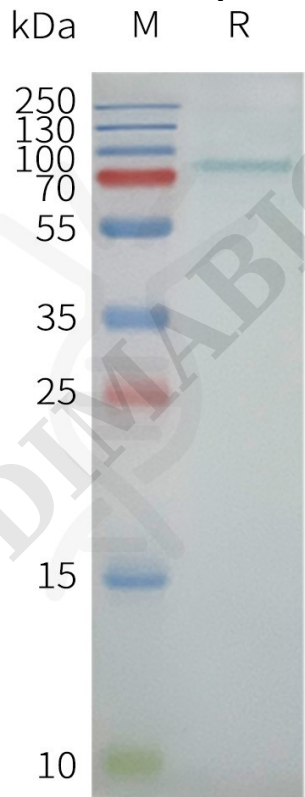
Figure 2. Human ABCG2-Nanodisc, Flag Tag on SDS-PAGE