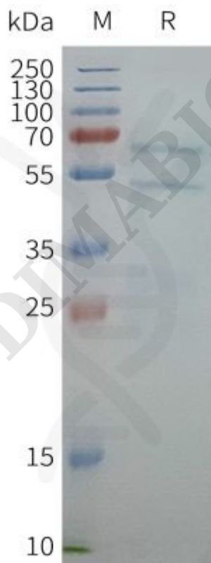
Figure2. Human ABCG1-Nanodisc, Flag Tag on SDS-PAGE