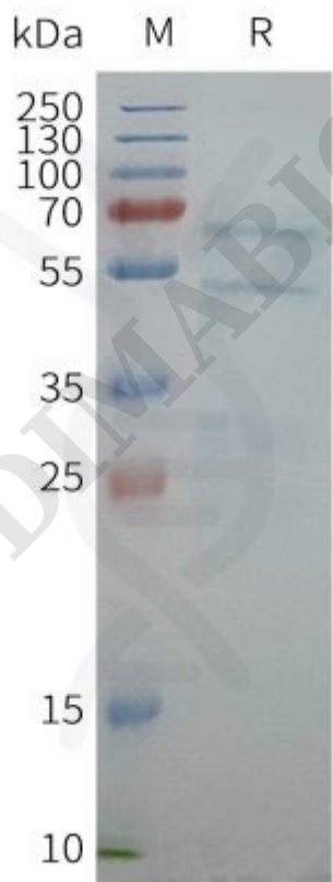
Figure2. Human ABCG1-Nanodisc, Flag Tag on SDS-PAGE