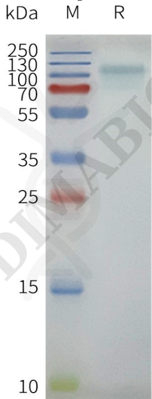
Figure 2. Human \beta 2AR-GPR75-BRIL-Nanodisc, Flag Tag on SDS-PAGE