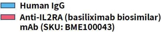
Figure 1. Flow cytometry analysis of human CD25 overexpression using Hu_CD25 K562 Cell Line (Cat. No. CEL100020) and Anti-IL2RA (basiliximab biosimilar) mAb (Cat. No. BME100043)