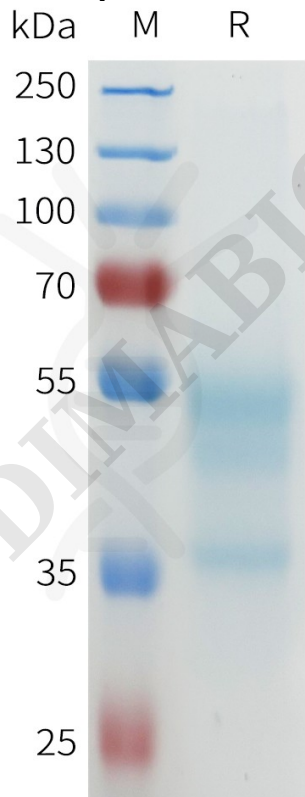
Figure 2. Biotinylated Human CXCR4-Nanodisc, Flag Tag on SDS-PAGE